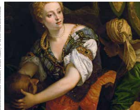
Paolo Veronese, Judith with the Head of Holofernes, ca. 1582, Kunsthistorisches Museum, Picture Gallery

We would be happy to create an exclusive package for you.